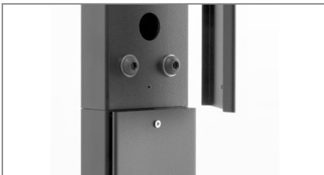
Cable management within the frame and the columns