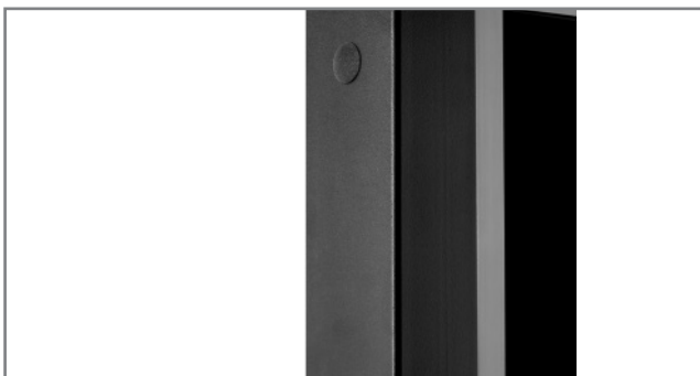
Scratch resistant powder coating